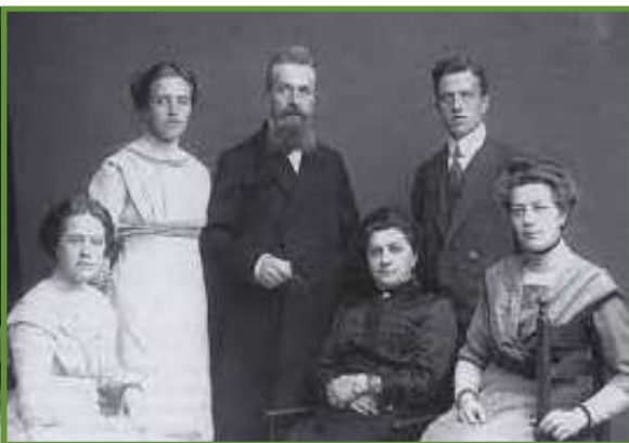
The Ten Boom Family